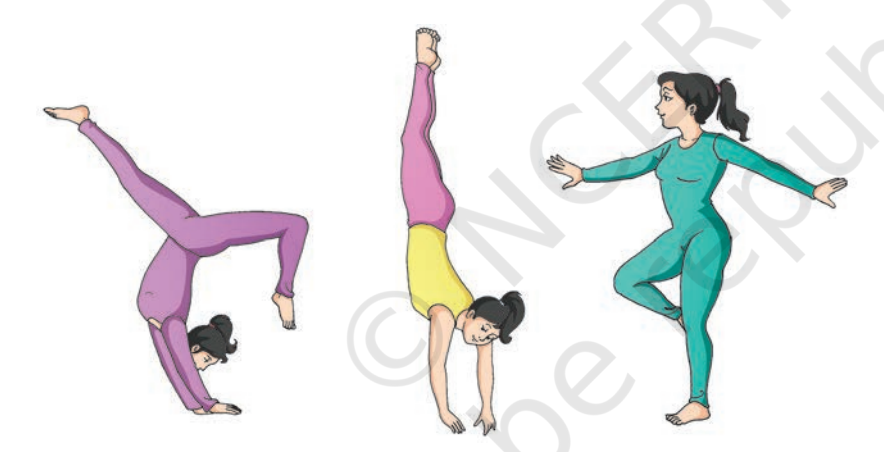
Fig. 1.5: Players performing gymnastics

Gymnastics include different exercises, without apparatus, and with apparatus. These exercises involve arm, leg, hand and trunk movements as well as performing jumping movements, and maintaining balance. It constitutes agility exercises done on various kinds of gymnastic apparatus like, parallel bars, horizontal bar, beam, pommel horse, ring, etc.