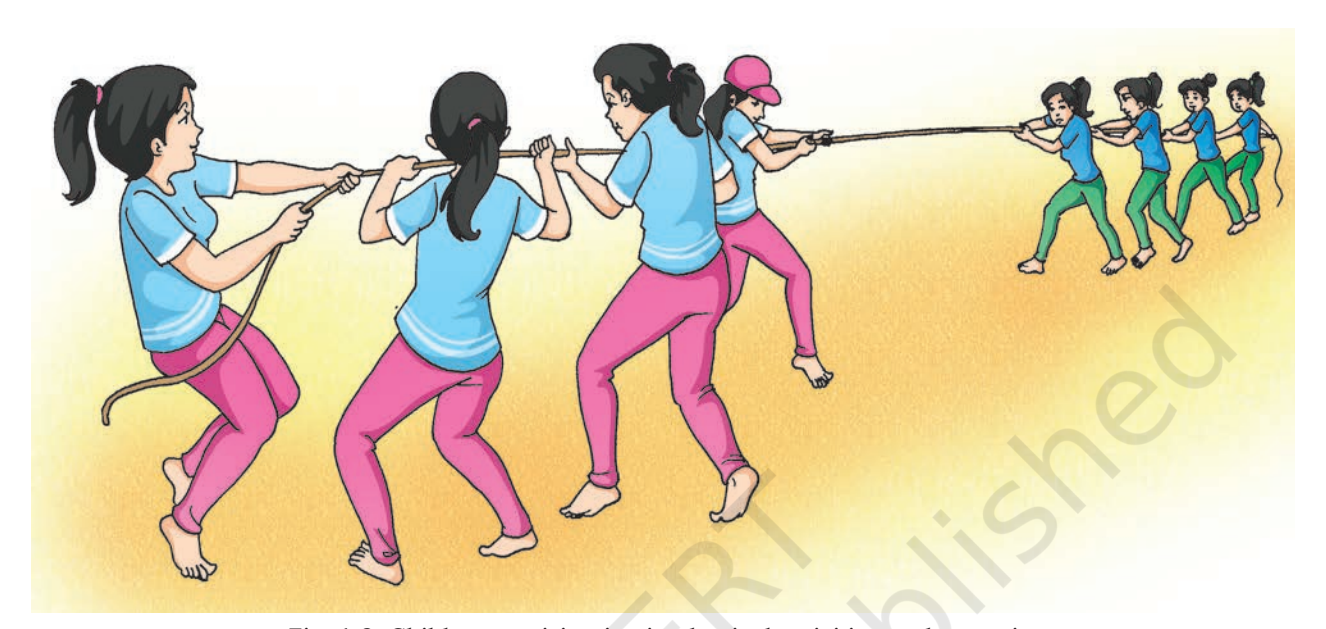
Fig. 1.3: Children participating in physical activities and excercise

fatigue and laziness and feels confident in life. It also promotes sound health which enables an individual to become a valuable asset for the society and nation.