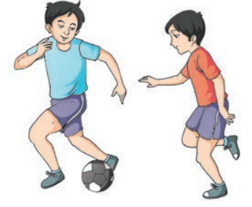
Fig. 1.4: Children playing football

It is often considered as an activity played by more than two people combined as a team. There are defined objective, time, space, rules, and limited pattern of behaviour, the outcome of which is to determine a winner or loser.